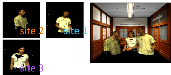
Figure 1. The Tele-immersive Setup.

Copyright 2008 ACM 978-1-60558-011-1/08/04...$5.00